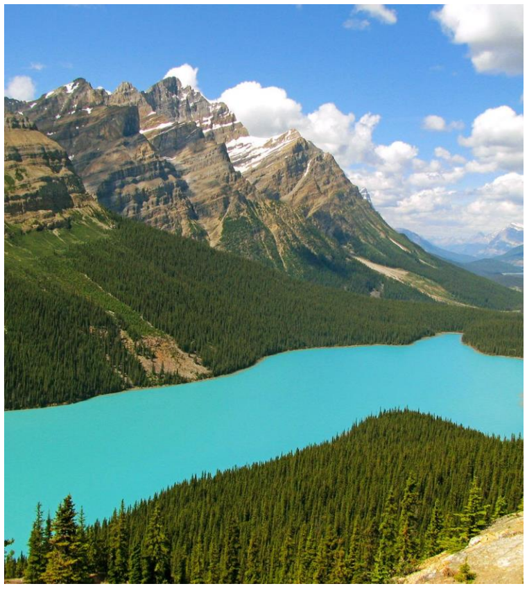
7 Days • 10 Meals: 6 Breakfasts, 1 Lunch, 3 Dinners

HIGHLIGHTS... Head-Smashed-In Buffalo Jump, Waterton Lakes National Park, Glacier National Park, Going-to-the-Sun Road, Banff, Athabasca Glacier, Lake Louise, Heritage Park Historic Village